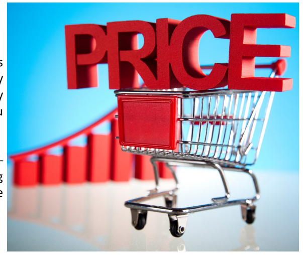
(Continues Next Page)

Do your numbers and make sure you know your costs and breakeven point. Again, we can help you do some financial modelling based on different price points that will help you understand the impact of different prices on your profitability.